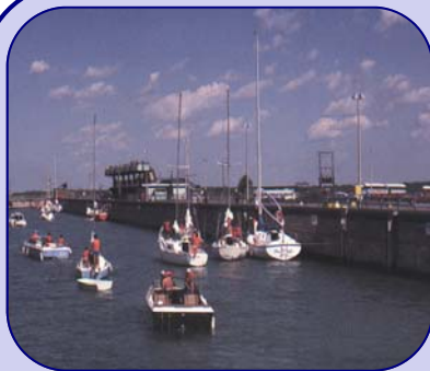
Andrews Street Park along the Grasse River

Massena Memorial Hospital in Massena, NY is currently seeking BC/BE Urologist for a hospital-owned practice. Opportunity to spearhead the development of a new hospital-owned practice and service line.