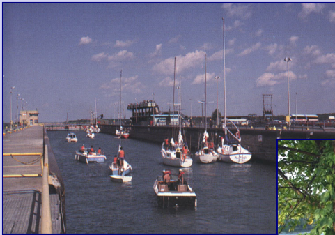
Andrews Street Park along the Grasse River

Here is an opportunity to practice in a community where a number of young physicians are gathering to escape the saturated areas that have limited their practice and quality of life.