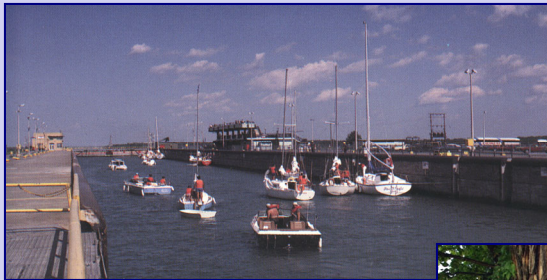
St. Lawrence River Eisenhower Locks Massena, NY

Here is an opportunity to practice in a community where a number of young physicians are gathering to escape the saturated areas that have limited their practice and quality of life.